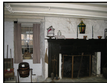
The Grimes Cellar Kitchen