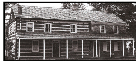
The Compass Inn

In addition to the cellar and main floor, the house is believed to have had an attic or loft, as evidenced by a roofline marking created during remodeling in the 1820s. This attic or loft, where children and servants may have slept, could have been accessed by a ladder or stairs located where the home's back stairs are today. Mr. Grimes' house, now the Evergreen Museum , is available for tours (see page 4).