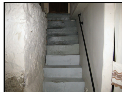
The Grimes Cellar Stairs