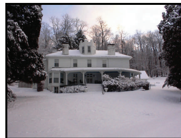
Evergreen in Winter

This winter, as many of you in the eastern part of the country know, was very generous in terms of storms, and for many of us, snowfall. Our neighbors in Garrett County were particularly hard hit, achieving a new record snowfall of over 260 inches as of March 7th (more than double its snow for the previous six years, per the chart shown below). At Evergreen, our snowpack seemed to peak at about four feet, but lasted for weeks, which resulted in a very tough winter for our trees, plants, and wildlife.